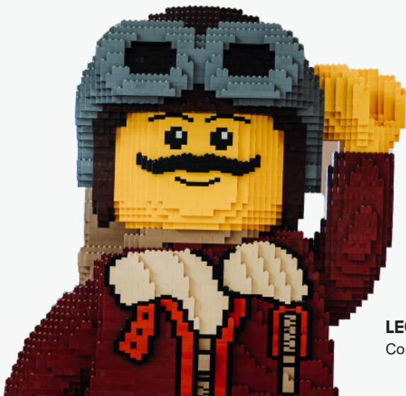
LEGO Store Concourse D